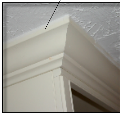
Crown Molding 3-5/8"

Alternative Selections are Available at Additional Costs